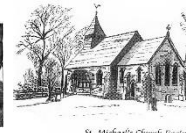
St. Michael's Church, Eggington