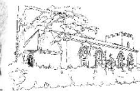
Good Shepherd, Greenleas School, Sandhills