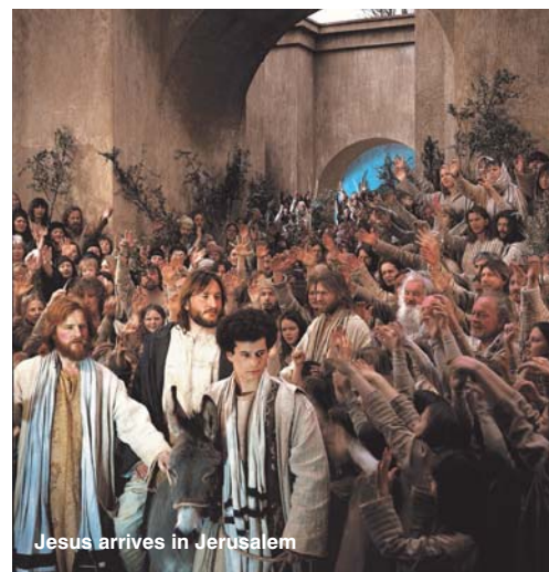
Jesus arrives in Jerusalem

This morning we visit Linderhof Palace. Built between 1874 and 1878 and the smallest of King Ludwig II's three royal castles, Linderhof was originally intended as a hunting lodge but later he declared it would be a new Versailles and the wonderful French Rococo interiors and beautiful parkland certainly reflect that ambition. We spend the afternoon at leisure in Garmisch, and you may choose to join our optional Zugspitze Cogwheel Railway journey.